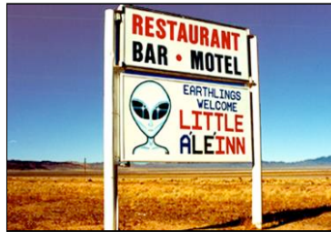
Lunch at the famous Little A'le' Inn