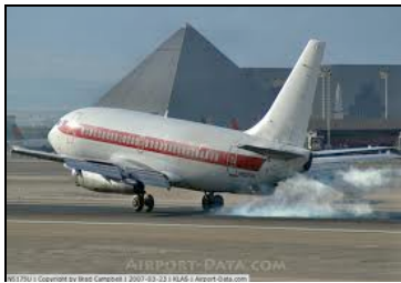
Janet planes returning from Area 51