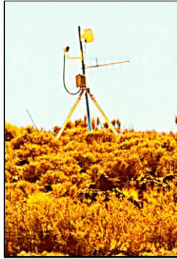
Remote cameras & listening devices