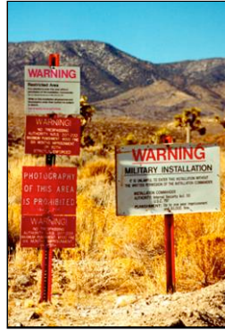
"Use of Deadly Force Authorized"