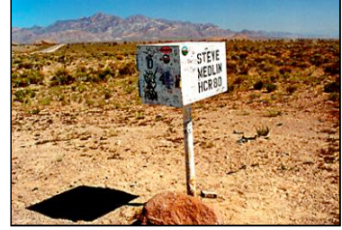
The "Black" Mailbox