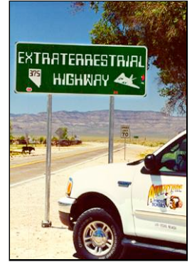
It's official! Many UFO sightings have happened here