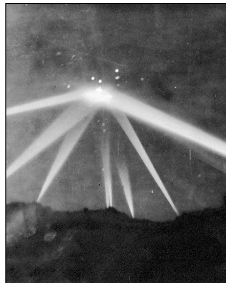
Only known photo of the "Battle of Los Angeles" UFO from February 25, 1942.